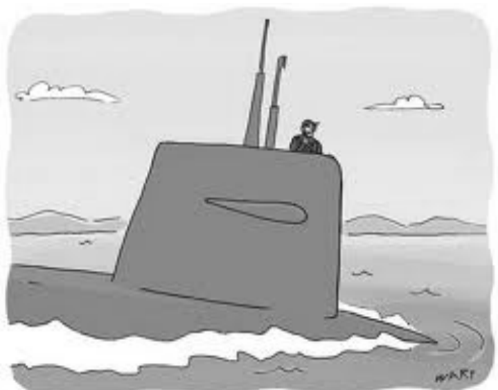
"Hey, it's been great talking to you, Mom, but I really have to go."