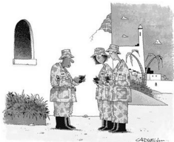
"Okay, we'll meet back here at 1600 hours. Synchronize your BlackBerries."